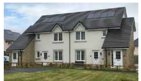
Bonnyrigg, Midlothian, Melville Housing Association