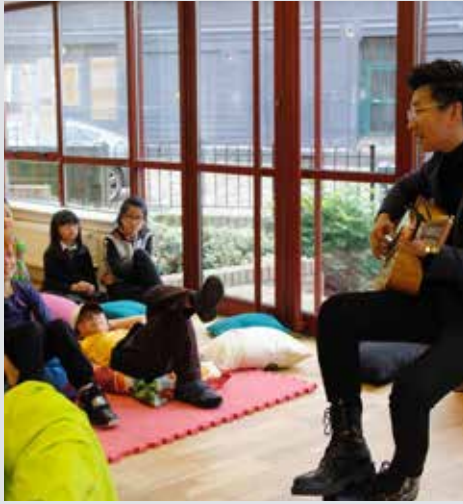
The Queens Cross Community Chest fund was launched in January 2018